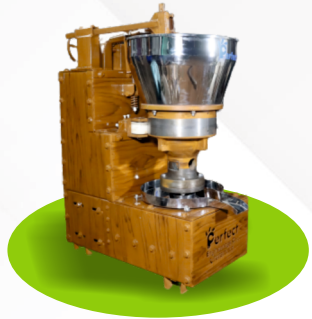
WOODEN CHEKKU 20Kg