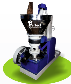
ROTARY - 60kg/Hr.(20 kg/Batch)