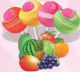
ASSORTED PACK FRUIT FLAVOURED BUBBLE GUM LOLLIPOP