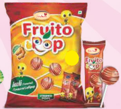
A range of fruity & tangy Lollipop's