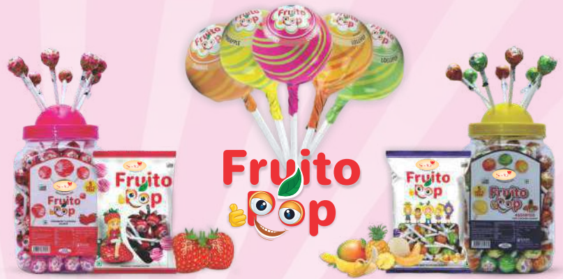
It's a delicious strawberry flavored lollipop Just pop it in and enjoy the magic.