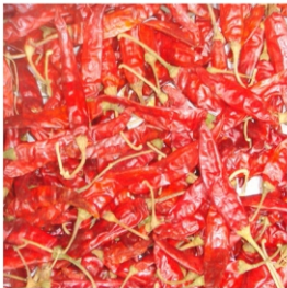
Sannam with Stem Heat Value : 15000 Color Value : 35