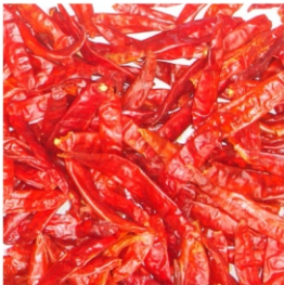
Sannam Stemless Heat Value : 15000 Color Value : 35