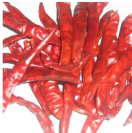
Teja Stemless Heat Value : 75000 Color Value : 50