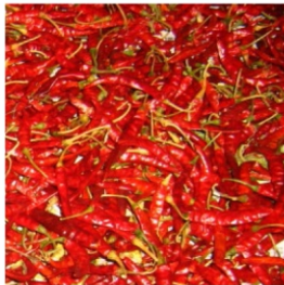
Teja with Stem Heat Value : 75000 Color Value : 50